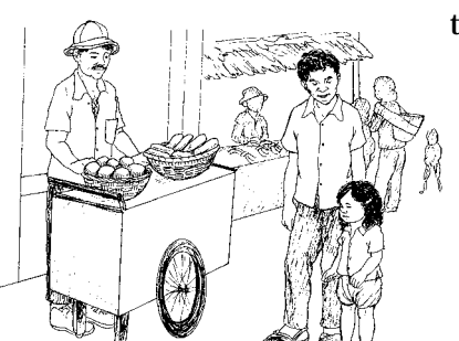
Explain the sounds and smells to your child when you go to the market.

It is important to think about how to do early assistance activities in ways that do not make more work for you. By making everyday activities into learning experiences,