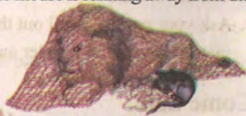
The mouse cut the net.