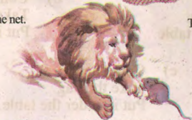
The mouse and the lion are now friends.