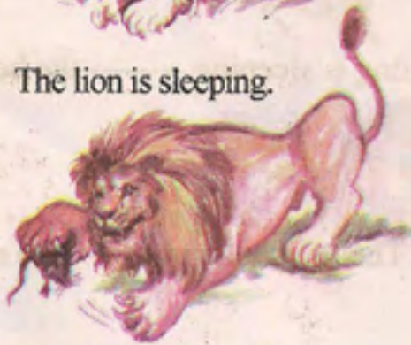
The lion caught the mouse.