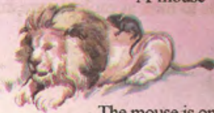
The mouse is on the lion.