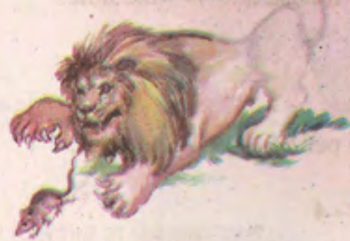
The mouse is running away from the lion.