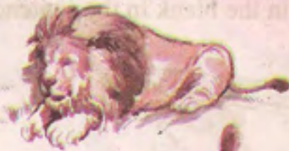
The lion is sleeping.