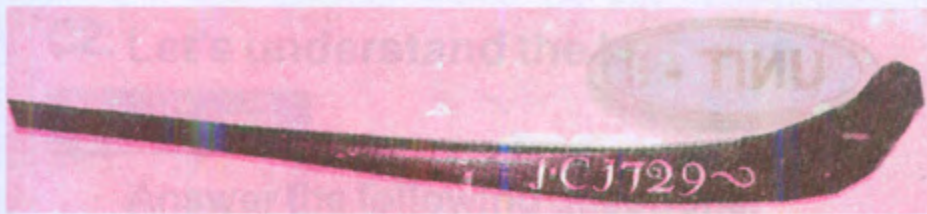
The oldest Cricket bat in existence (Note the curved end, similar to a hockey stick)

Today, as you know, the ball is bowled over-arm, and the shape of the cricket bat has also changed. One part of the bat now is a piece of rectangular 2 wood. This piece is made of the wood of the willow 3 tree. The other part, the handle, is made of cane.